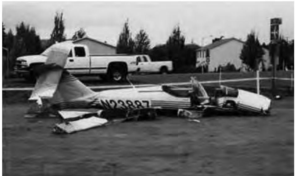
A flight instructor and his student were paralyzed when the plane they rented crashed following takeoff. The culprit was determined to be a malfunctioning carburetor that had not been maintained in over 10 years.

Although there are situations where the NTSB does a fantastic job with its investigation, the fact that victims have no involvement in the investigation and cannot access the wreckage until after the NTSB and FAA release the data is inherently problematic. In some instances, the NTSB will take over two years to conduct its investigation. This can present issues involving a statute of limitations defense or the compromising of evidence which has been deteriorated, lost or destroyed. As a result of these inherent problems, it is incumbent upon counsel to get started with its investigation (as much of it as can be done) as soon as possible — even while the NTSB investigation is still